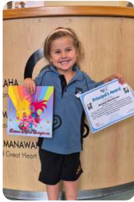
Ahorangi Taumata 4