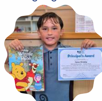
Cyrus - Kaiweka 17