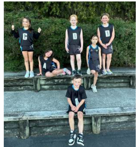
Legend of the forest run...