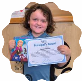
Roslyn - Taumata 9