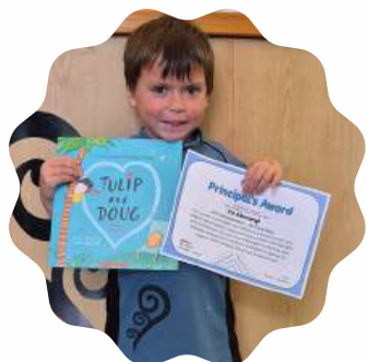
T.K - Taumata 3