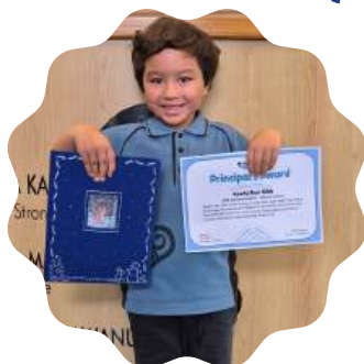
Kawhi-Rua - Taumata 5