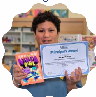
Rongo - Kaiweka 16