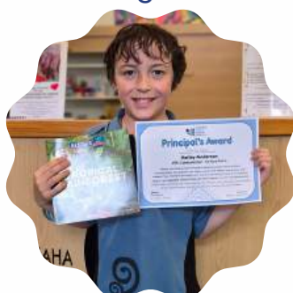
Harley - Kaiweka 15