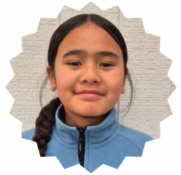
Aloura – Kaiweka 15