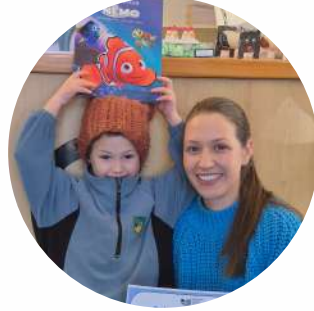
Cully – Taumata 5