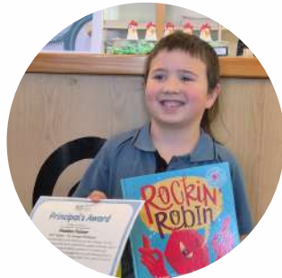
Maddox – Taumata 4