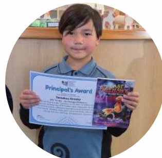
Tamahou – Angitu 7