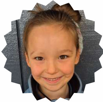
Brooklyn – Taumata 5