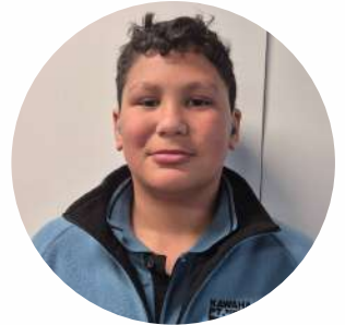
Rongo - Kaiweka 16