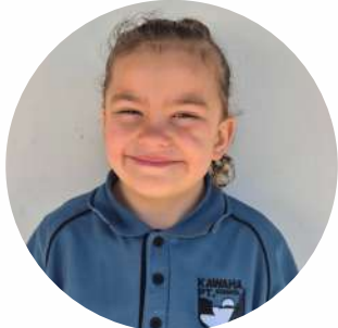
ShineJoy - Taumata 9