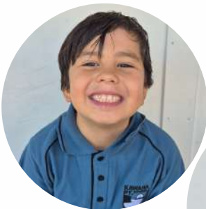
Te Wahi - Ngongotaha 11