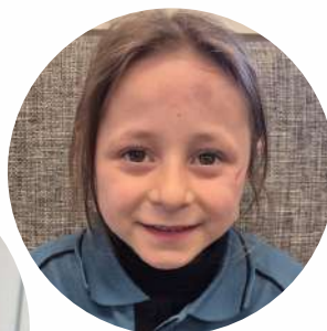
Manaia - Ngongotaha 11