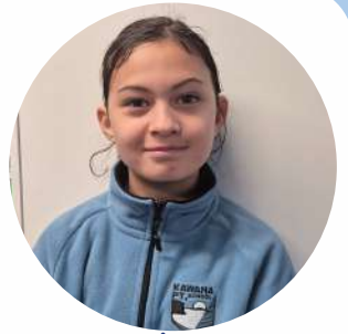
Horizon - Kaiweka 16