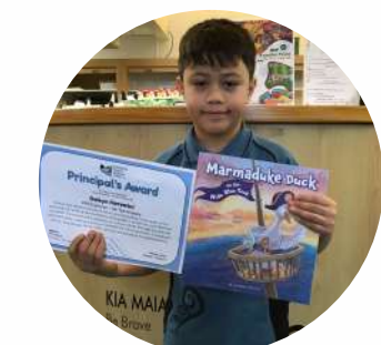
Deikyn - Angitu 8