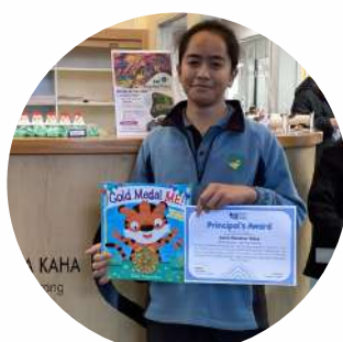
Kaine - Angitu 7