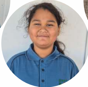
Rangihemo - Ngongotaha 11