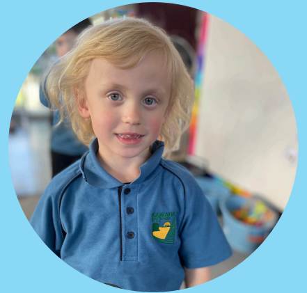
Ruby - Space 3