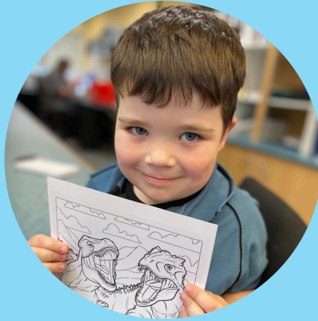
Leo - Space 3