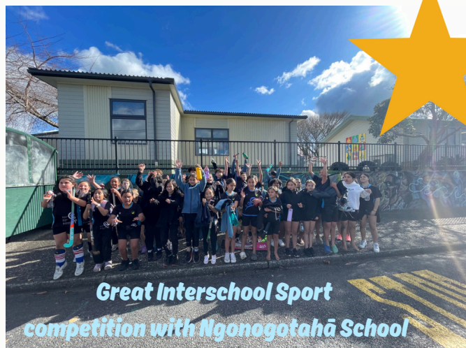
Great Interschool Sport competition with Ngongotaha School

Kia Kaha- Be Strong * Kia Maia- Ne Brave* Kia Manawanui- Be Kind. * Kia Angitu- Be Successful