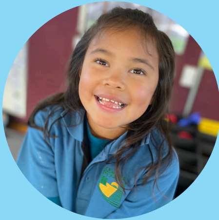
Hineaio - Space 3